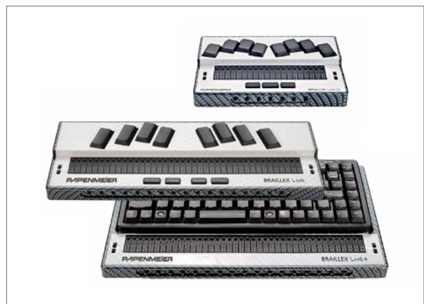
BRAILLEX® Live, Live+, Live20

User's manual, case, power supply unit, USB connection cable